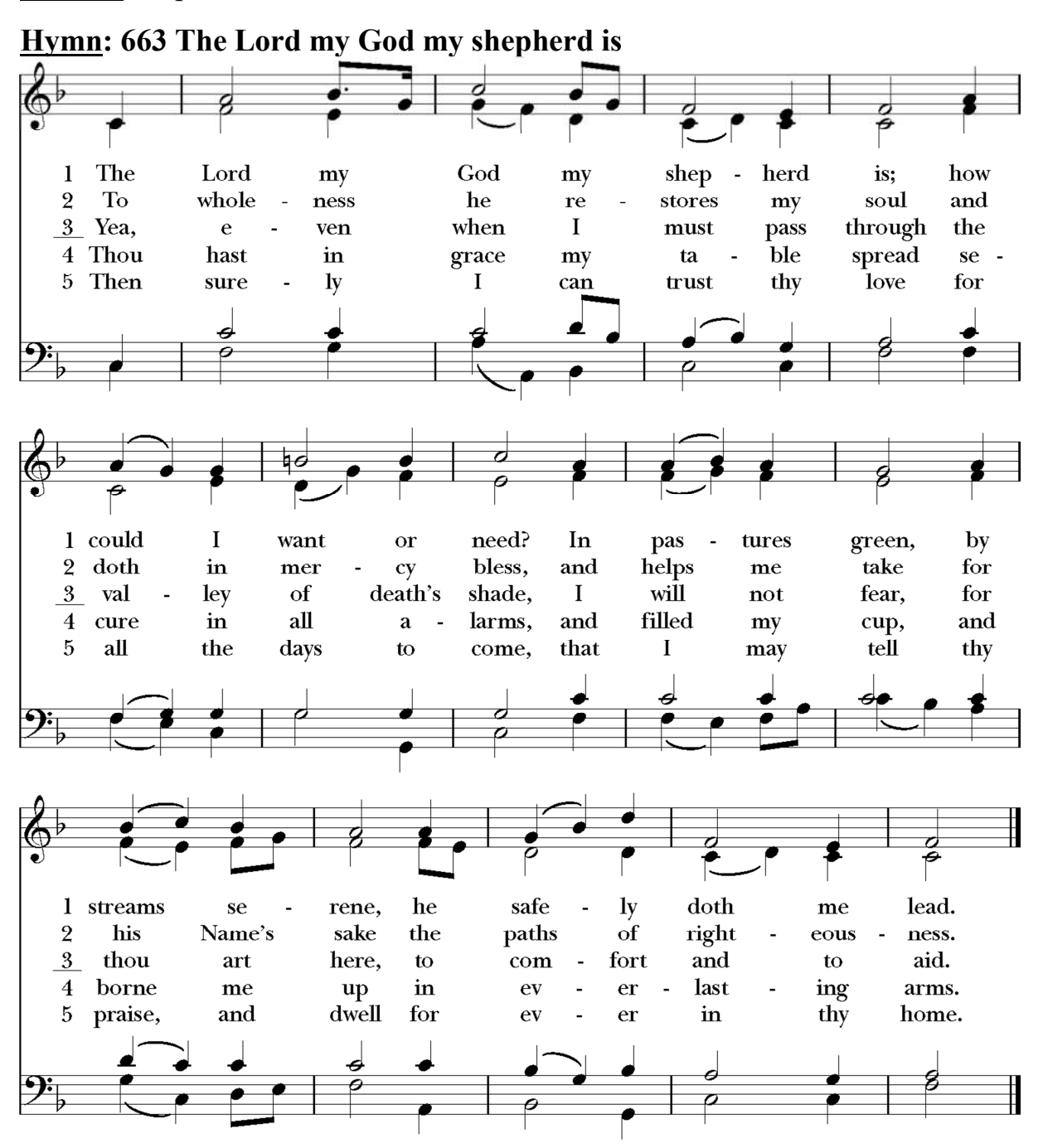
The Word of God

Prelude: Improvisation on Crimond Eric H. Thiman