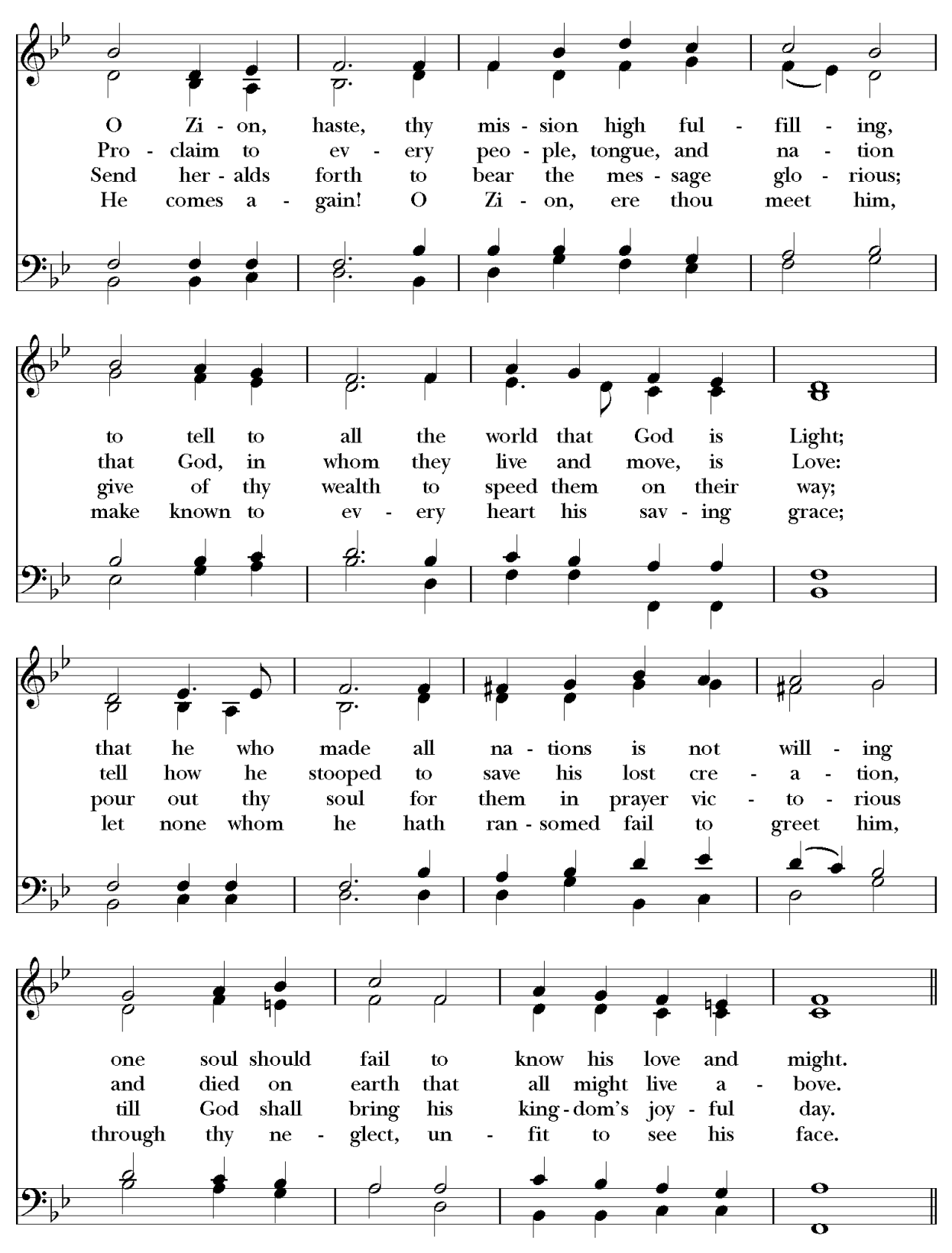
(over for music continuation)